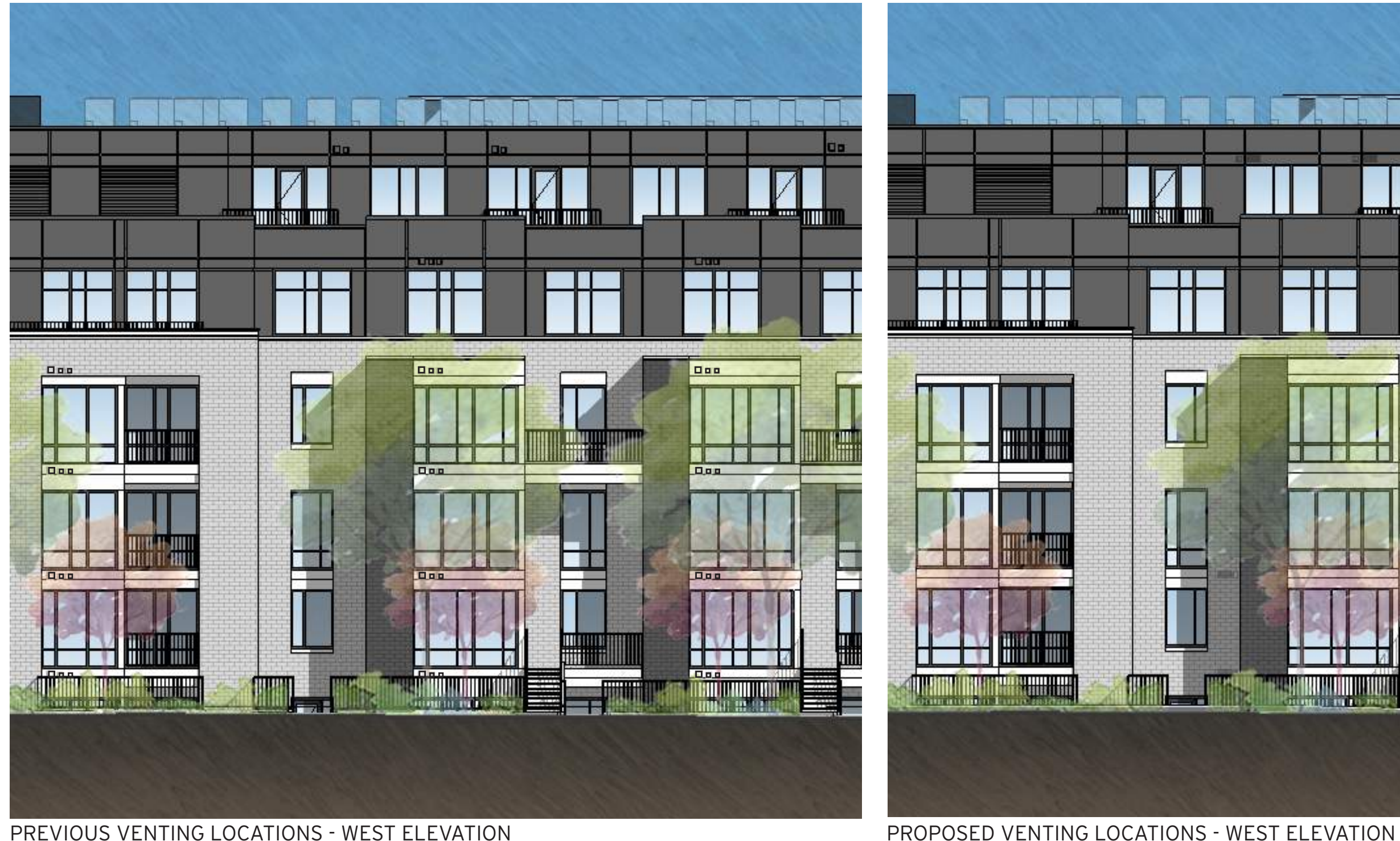
PREVIOUS VENTING LOCATIONS - WEST ELEVATION